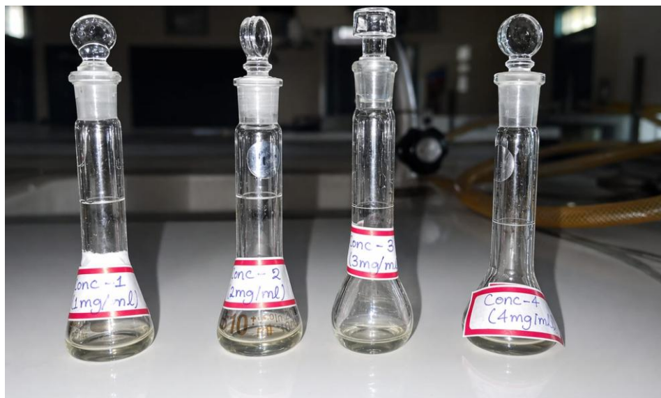
Figure 2: \alpha -Amylase inhibitory activity of different concentrations of Pithecellobium dulce leaf extract.