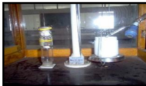
Fig.1. Developed balance for determination of bioadhesive strength

Twenty tablets were weighed individually and checked for the weight variation. Thickness was measured using vernier callipers. Five tablets of each formulation were taken and amount of drug present in each tablet was determined. The surface pH of tablet was determined in order to investigate the possibility of any irritation in the oral cavity. The tablets were kept in contact with stimulated saliva fluid for two hours and pH was noted by bringing the electrode in contact with surface of the formulations. Bio adhesive strength of the tablets were measured in a modified physical balance using methods discoursed by Gupta et al. 9 Sheep buccal mucosa was used as model mucosal membrane and stimulated saliva fluid as moistening fluid.(Figure-1)