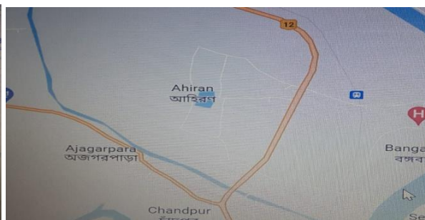
Location of Study Area