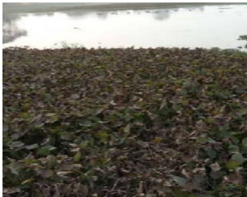
Figure 1. Aquatic Macrophyte of Ahiron wetland.