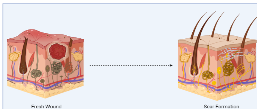
Fig. 2: Classic Wound Healing

Classic Wound Healing: The physiological result of mammalian wound healing is scar formation. Several examples show that inflammation during the healing of a wound is closely related to how much scar tissue forms 81 .