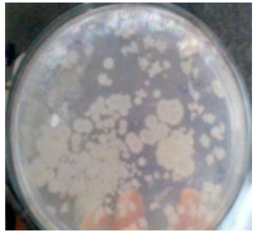
Figure 1 Nutrient agar plate with Bacillus sps colonies