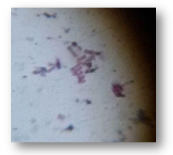
Figure 3: Microscopic field view of sudan black B staining of Bacillus sps showing blue-black PHB granules

4. Estimation of PHB from the isolated sample: The production media by successive treatment of the solvents yields PHB in the form of pellet. Standard curve of PHB is studied by using the pellet. The extracted polymer from the Bacillus sps. as pellet which is solubilised in concentrated sulphuric acid. The absorbance of PHB was