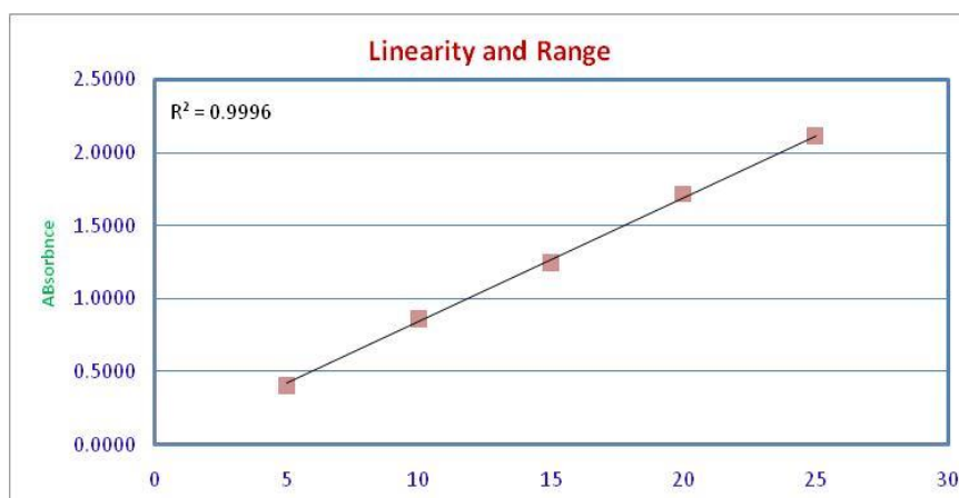
Figure 3: Linearity and Range of Cilnidipine