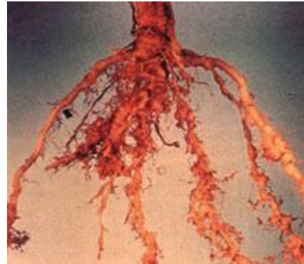
Root galls of root-knot nematodes.

Aboveground symptoms Root-knot nematodes are usually first detected in localized areas within a field greenhouse, high-tunnel, nursery, or home garden. Gradually, the area of infected plants expands in size and the entire planting can eventually be affected. Aboveground symptoms usually involve stunting, chlorosis (yellowing) of lower leaves (nitrogen deficiency symptoms) and yield reductions that often worsen over time. Plants may wilt during the heat of the day, especially under dry conditions or in sandy soils. Since these symptoms can also be caused by a number of unfavorable growing conditions and other diseases, diagnosis of root-knot requires an examination of the root system or an inspection of the adjacent soil for nematodes.