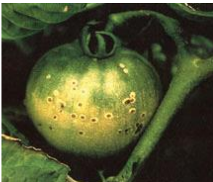
Bird's eye spot of bacterial canker.

Tomato plants of all ages are susceptible to bacterial canker; all above-ground parts are susceptible. Symptoms on seedlings include small, water-soaked lesions on foliage; stunting; and wilting. Seedlings affected by bacterial canker will die in many cases.