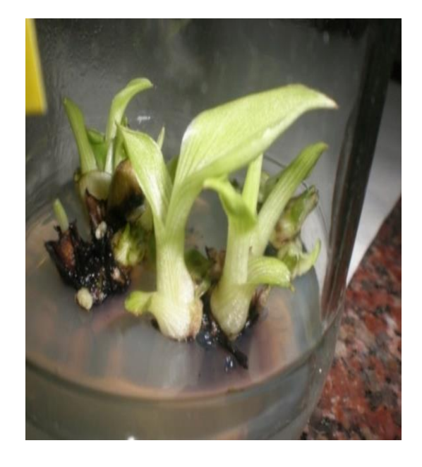
FIGURE 1: Shoot proliferation

Dwarf plants were most difficult to identify during primary hardening, this dwarf plants were identified mostly towards the end of secondary hardening.