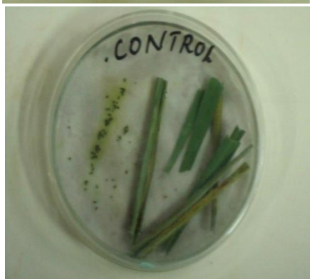
Plate-1: control paddy (leaves active feeding - Cnaphalocrocis medinalis )