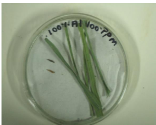
Plate 7: Rice leaves treated with extract of I. carnea 100% EtOH (100ppm) Leaf folder - 100% Mortality (12 hrs)