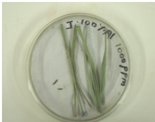
Plate:-8 Rice leaves treated with extract of J. curcas 100% EtOH (1000ppm) Leaf folder - 100% Mortality (12 hrs.)