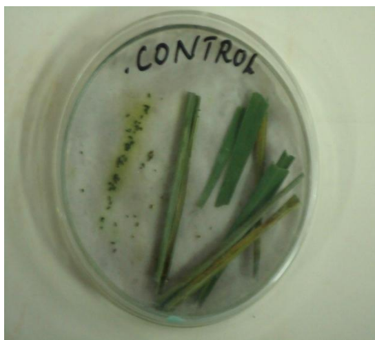
Plate 6: control (active feeding)