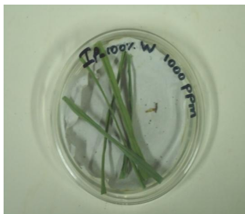
Plate:-10 Rice leaves treated with Water extract of I carnea at 1000ppm, Leaf folder - Mortality (48 hrs)