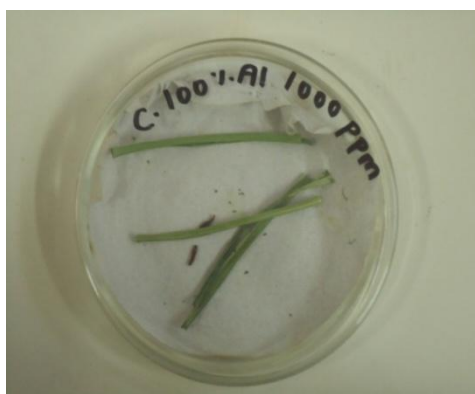
Plate:- 9 Rice leaves treated with extract of C gigantea 100% EtOH at 1000ppm. Leaf folder - 100% Mortality (12 hrs.)