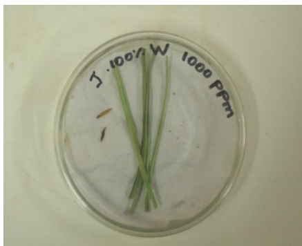
Plate:- 11 Rice leaves treated with Water extract of J. curcas Leaf folder - Mortality (48 hrs)