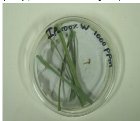
Plate:-2Rice leaves treated with Water extract of I. carnea at 1000ppm, Leaf folder - Mortality (48 hrs)