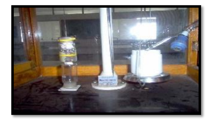
Fig.1. Developed balance for determination of bioadhesive strength

Twenty tablets were weighed individually and and checked for the weight variation. Thickness was measured using vernier callipers. Five tablets of each formulation were taken and amount of drug present in each tablet was determined. The surface pH of tablet was determined in order to investigate the possibility of any irritation in the oral cavity. The tablets were kept in contact with stimulated saliva fluid for two hours and pH was noted by bringing the electrode in contact with surface of the formulations. Bio adhesive strength of the tablets were measured in a modified physical balance using methods discoursed by Gupta et al.9 Sheep buccal mucosa was used as model mucosal membrane and stimulated saliva fluid as moistening fluid.(Figure-1)