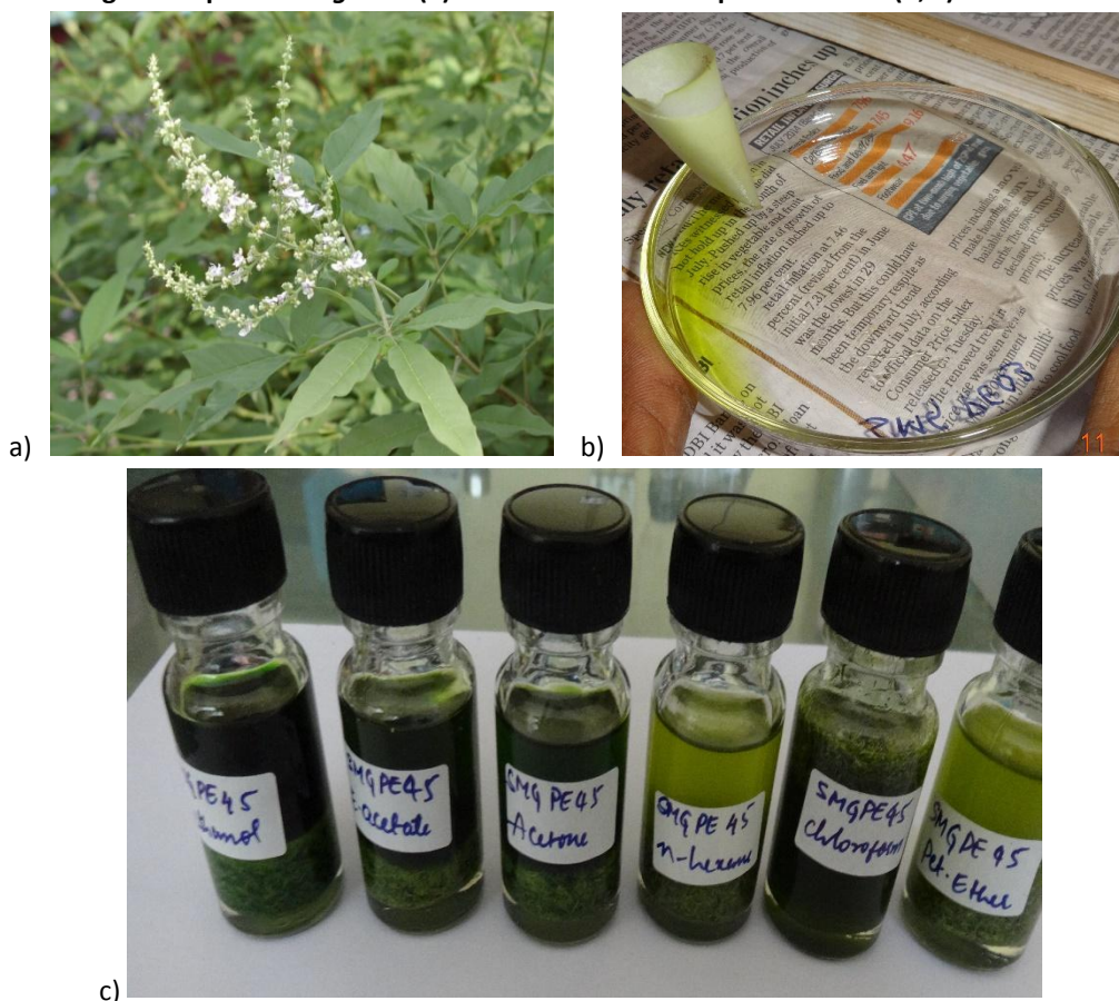
Fig.1. The plant V.negundo (a) and collection of the plant extracts (b, c)

One gram of dried plant material was dissolved in 10ml of solvent in air tight bottles (Fig 1c). The mixture was maintained on an orbital shaker at 120 rpm in dark for 3 days. The solution obtained was filtered and the solvent was evaporated overnight (Fig 1b). The extract obtained was dissolved in 500 \mu l of DMSO and transferred to a sterile screw cap glass vial.