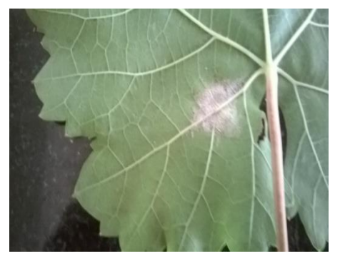
Figure 2: Downy mildew of grape