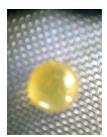
Figure No. 3: Lens after 72 h of incubation with glucose 55 mM+ \alpha -amyrin 500 \mu g /ml.