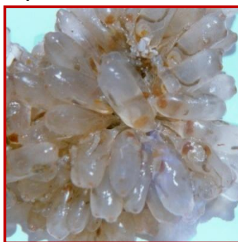
Figure 1: Colony of Ecteinascidia venui Meenakshi, 2000

carried out based on the key to identification of Indian ascidians [8]. A voucher specimen AS 2247 has been submitted in the ascidian collections of the museum of the Department of Zoology, A. P. C. Mahalaxmi College for Women, Tuticorin – 628002, Tamilnadu, India. (Figure 1)