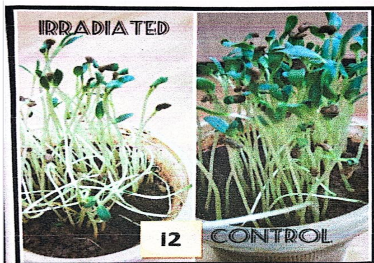
Figure No. 1 Trigonella plants with Wi Fi Router effect

Results and Discussion: Plants serve as a great model for the study of the effect of EMF as they are immobile and can react immediately to the change in environment. The seeds of Trigonella were exposed for different period intervals and sown into the pots and maintained in the laboratory to check the effects of the EMR on morphological and biochemical substances in plants. Figure 1 seedlings of Trigonella with controlled and irradiated condition. The control plants were healthy as compared to the irradiated one.