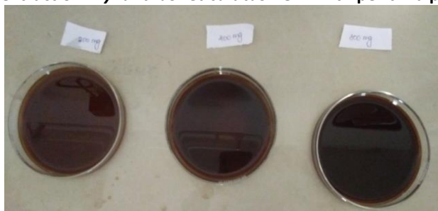
Figure no- 2: Aqueous extract of Phyllanthus reticulatus POIR with peritima posthuma at death stage