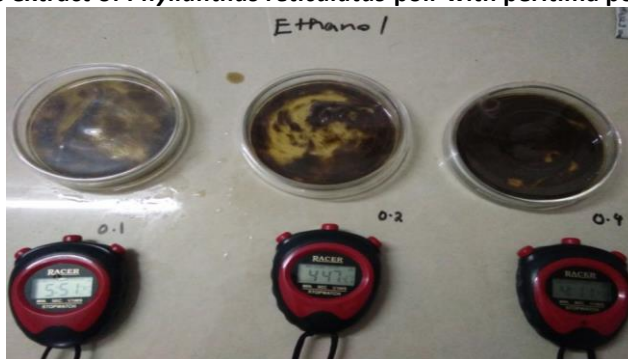
Figure no- 3: Ethanolic extract of Phyllanthus reticulatus POIR