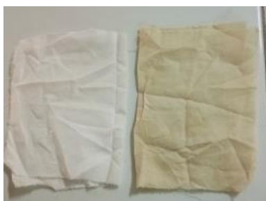
Plate 9: Fabric Dyed with the Extract