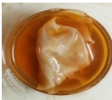
Plate 4: Dying of Fabric