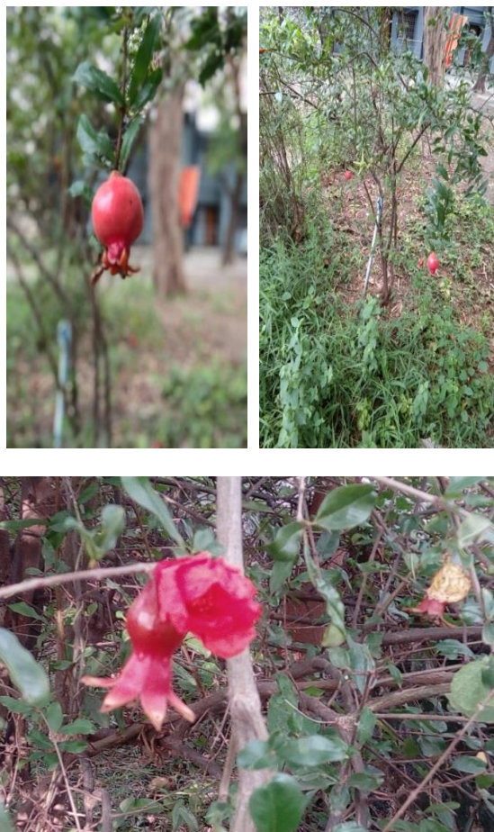
Plate 1: Pomegranate Plant

The extract is tested for the property to act as a pH indicator. This can be incorporated in the medium for microbial growth or can be used as pH indicator for biochemical tests that indicate the production of acid by the organism. The extract reacts to acid by producing deep red colour with a minimal amount of acid interaction. But it is less responsive to alkaline pH (Plate 10).