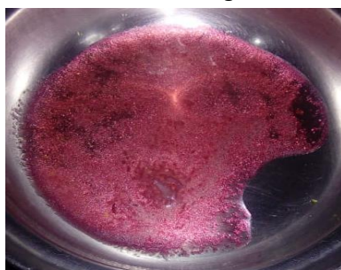
Plate 8: Coloured Food Stuff