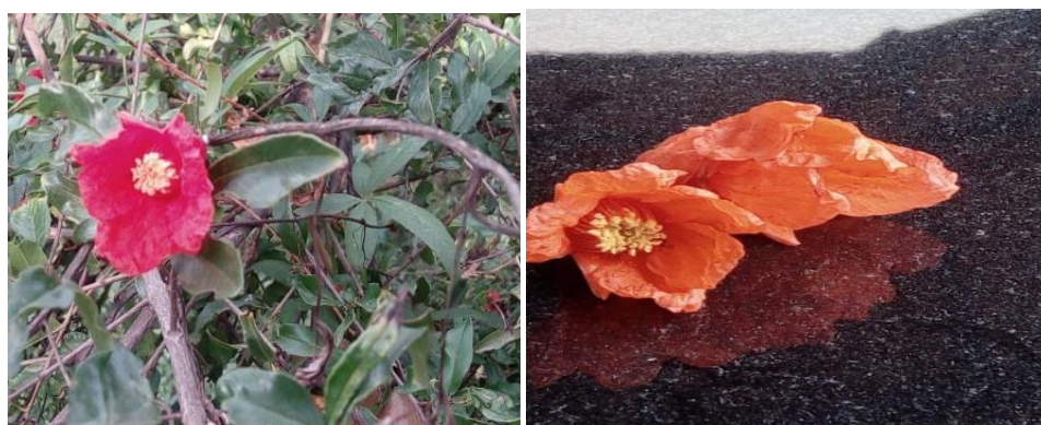
Plate 2: Flower Collection