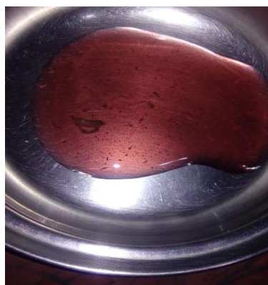
Plate 3: Food Colouring