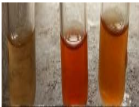
Plate 10: Used as Acid Indicator