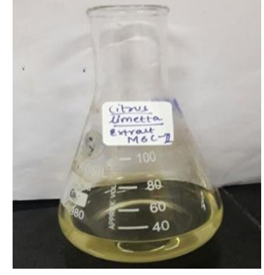
Fig.2- C. limetta (sweet lime) peel extract