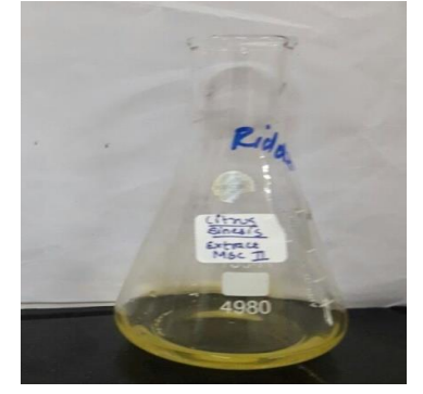
Fig. 1- C. sinesis (orange) peel extract

(Fig. 3). This indicates that the silver nanoparticles were synthesized using both the extracts.