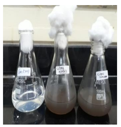
Fig. 3- Formation of Brown colour solution